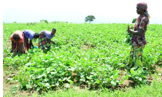
Figure 2. Kesho Congo provides work opportunities to rural women via harvesting activities

LPC can be formulated into traditional meals, flours, snacks and drinks. 6,7,9 It contains notable amounts of beta-carotene (provitamin A) and iron, a couple of the most prominent global nutrient deficiencies. 6,10,11 The COVID-19 pandemic emphasized the importance of strengthening domestic food relief solutions. Research and development on the LPC intervention is important to Kesho Congo's push for national progress towards alignment with the United Nations Sustainable Development Goals (SDGs); particularly, LPCs support Goal 2 to achieve zero hunger and Goal 3 to achieve good health and well-being. During a visit to Kesho Congo's operating sites in 2021, the United States Ambassador to the DRC, Mike Hammer, recognized their positive community impact.